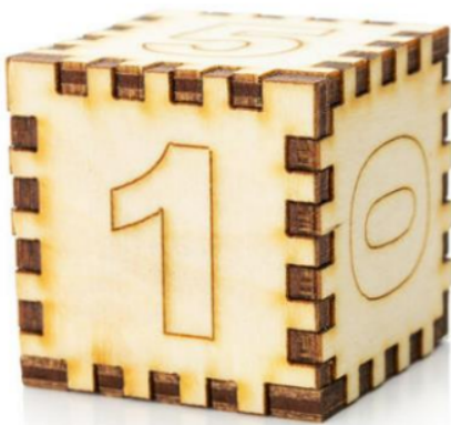
Picture 5. Laser cut wooden block

Laser technology is currently used in many fields such as automotive, shipping, aviation, military equipment, energy industry and medicine [15]. In addition, it has also found a place in applications such as semiconductor production, electronics and communications [16]. Hobby woodworking has also been involved in areas such as advertising and entertainment shows. With its use in measuring devices in industry, it has become a technology that has no alternative in most cases. Its use has gained importance especially in applications requiring high precision. As can be seen, laser technology has found its place in daily life for many different purposes, from small to large. In recent years, with the development of technology, there has been a trend towards the use of laser in industry [17].