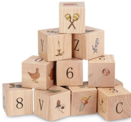
Picture 1. Solid wooden cubes.

Wooden blocks are one of the most used educational toys in preschool and infancy. Figure 1 shows blocks made of one piece of solid wood. Picture 2 and Picture 3 show traditional type wheeled wooden toys. These toys are generally produced by adding wheels to a single piece. Picture 4 shows the wooden miniature children's house, which has more parts than other toys. Since its assembly and durability are lower than other toys, it may not be preferred by parents.