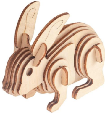
Picture 7. Laser cut layered wooden rabbit