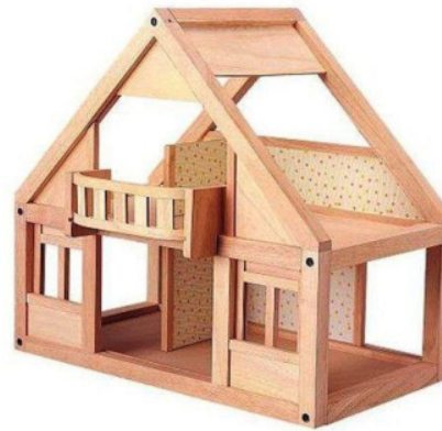
Picture 4. Wooden house with solid pieces

It is known that wooden toys produced from a single body have a longer lifespan than toys with multiple and more complex components.