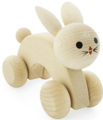
Picture 3. Wooden toy rabbit