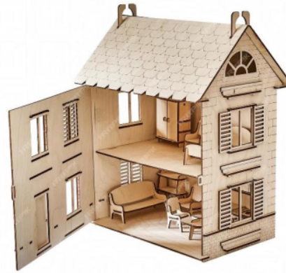
Picture 8. Plywood laser cut house

Toys produced by laser cutting are produced in a shorter time than traditional toys. As seen in Picture 5, Picture 6, Picture 7 and Picture 8, the high number of parts and low part thickness create a disadvantage in terms of strength.