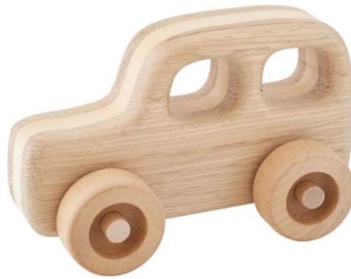
Picture 2. Solid toy car.