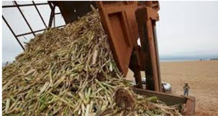
Fig. 1. Value-added agricultural residues.

2 - Agricultural residues: This involves crop residues like straw, husks, and bagasse. The figure displayed in Figure 1 illustrates how these leftover residues in the field post-harvest can be collected for energy production.