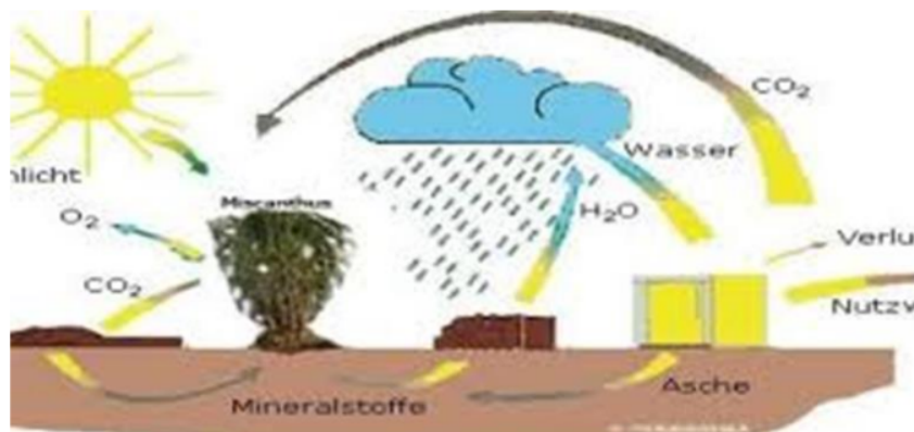
Fig. 5. Next generation energy.

- Energy Plants: These plants are grown with the specific purpose of producing energy, such as switchgrass, miscanthus, and rapidly growing trees like poplar and willow. The depiction in Figure 5 showcases the future of energy crops