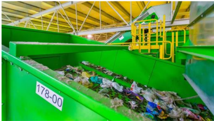
Fig. 4. Municipal and solid waste treatment.

Municipal and solid waste comprise a diverse range of materials that can be recycled, all gathered without prior sorting. Besides organic waste, there are various recyclable materials included in the input. Municipal and solid waste typically ranges in density from 0.1 to 0.3 Mg/cubic meter. To develop a captivating economic concept, it's crucial to gather and consider customer details on throughput capacity, waste composition, and objectives. A strong plant's bandwidth covers a spectrum from semi-automated to fully automated solutions. A considerable amount of flexibility and stability is needed. The illustration in Figure 4 displays the process of handling municipal and solid waste.