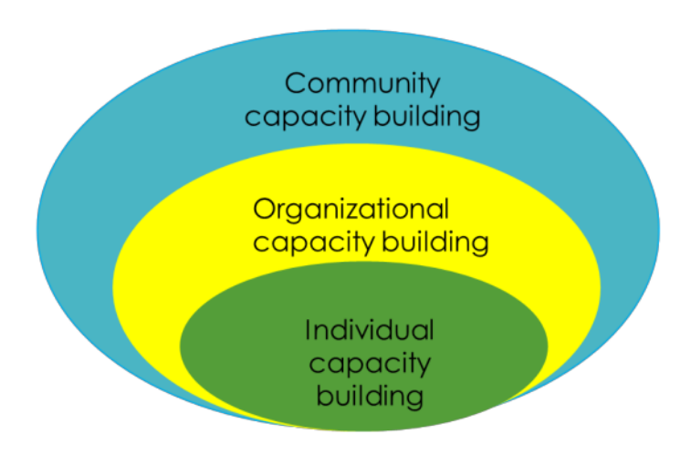
Figure1: Levels of community capacity building (Minkler & Wallerstein, 2011)

The three levels can be better understood through the table below: